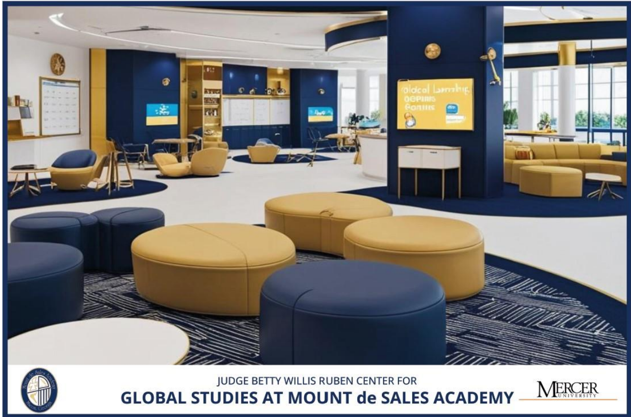
Concept rendering for the Judge Betty Willis Ruben Center for Global Studies at Mount de Sales Academy